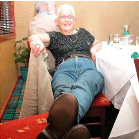
One glass of wine too many Sue??

I took a few photos', they are on my photo web site at www.paulstubbs.pozzie.net