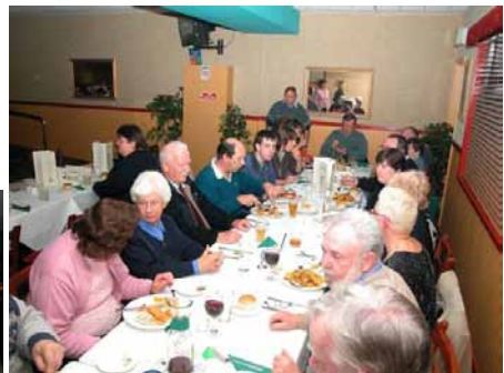
Good to see some of the newer members along.