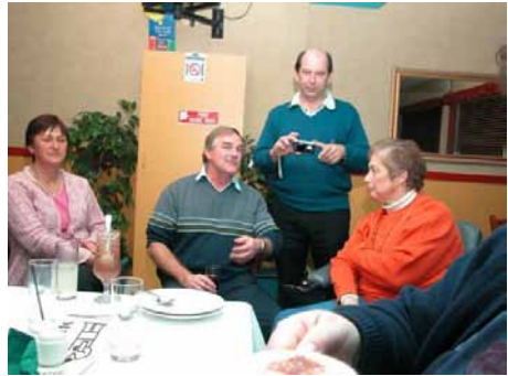
Ok now let me see who is photographing who??? Or is that whom??