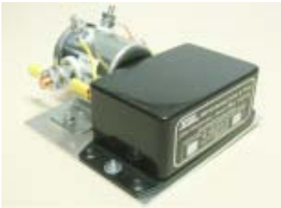
The SM155 battery link version is shown here

Who was the first person to look at a cow and say, "I think I'll squeeze these dangly things here and drink what comes out"? Who was the first person to say, "See that chicken over there ... I'm gonna eat the first thing that comes out if its butt"?