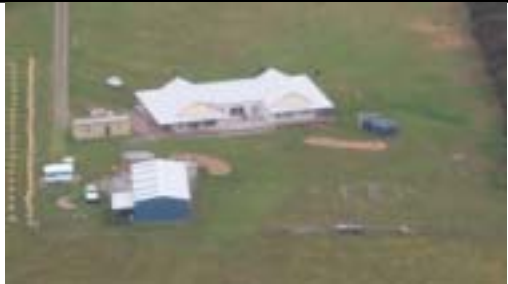
Ponderosa BQO from the air, see page 9 for story

So it's not really a doughnut after all.... It's a mushroom!