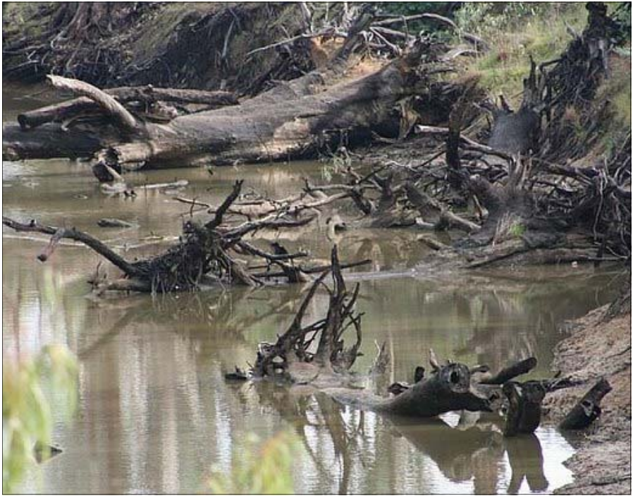
Poor Old River!