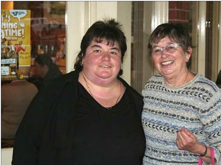
ECHUCA CAMP Cont'd