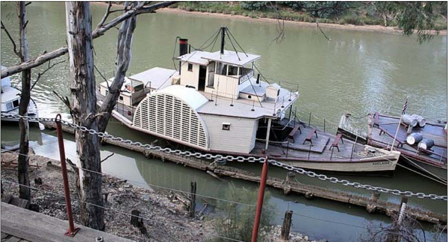
The Paddle Steamer Adelaide