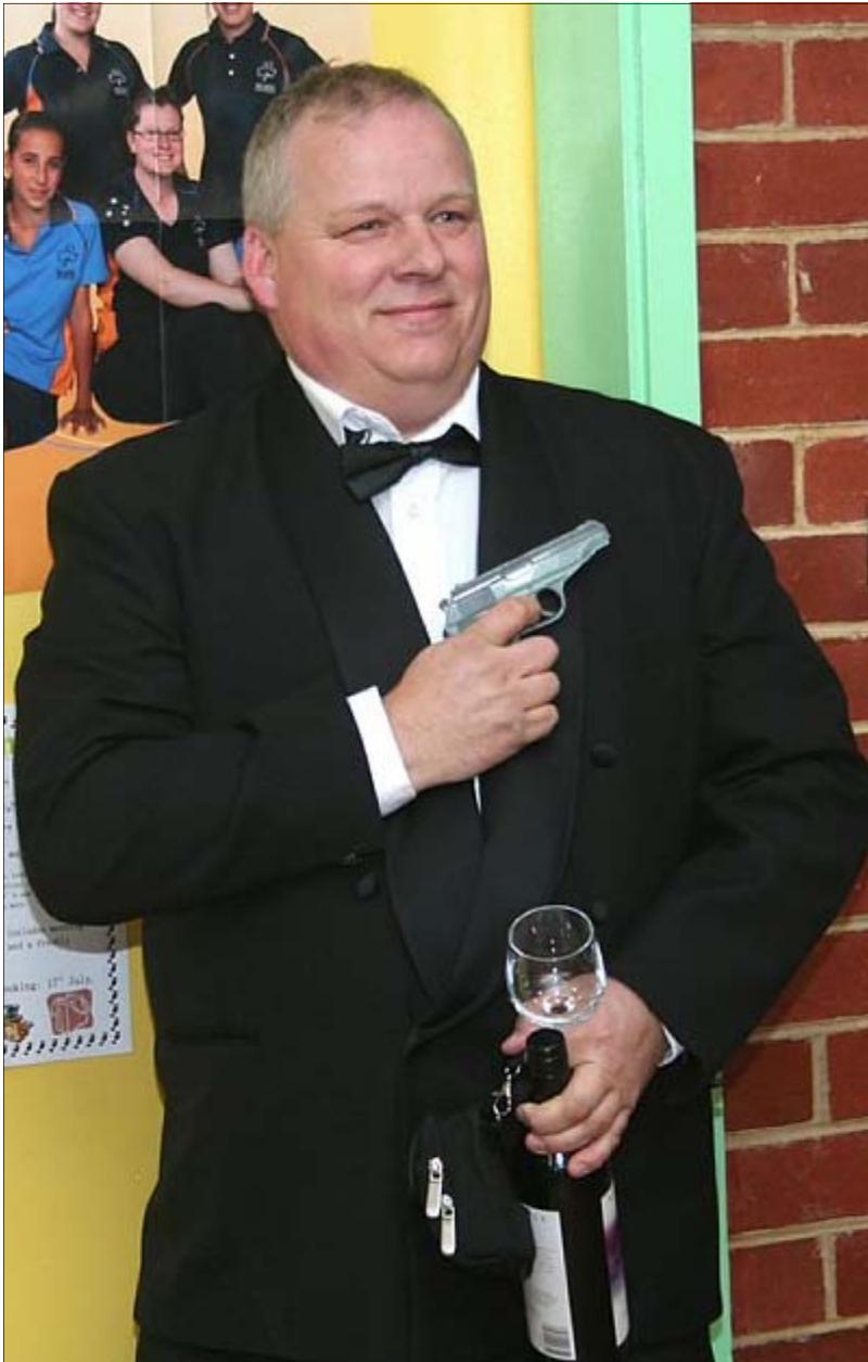
MID YEAR DIN- NER