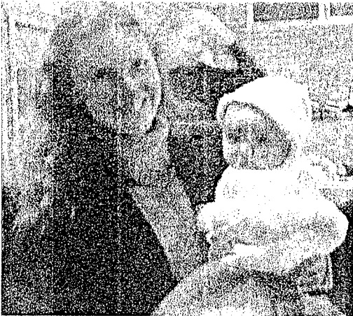
GIRLS NIGHT OUT.