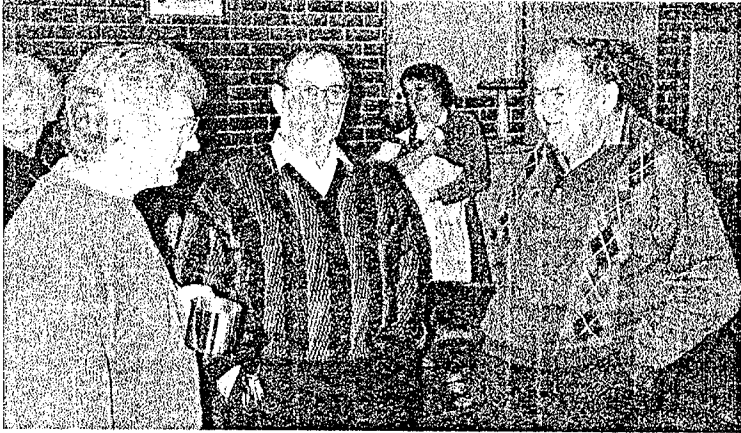
Nothing happening here, the GGREC school of loitering .