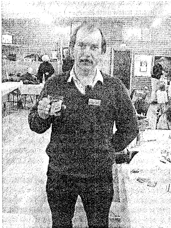
It's only gingerale, honest!