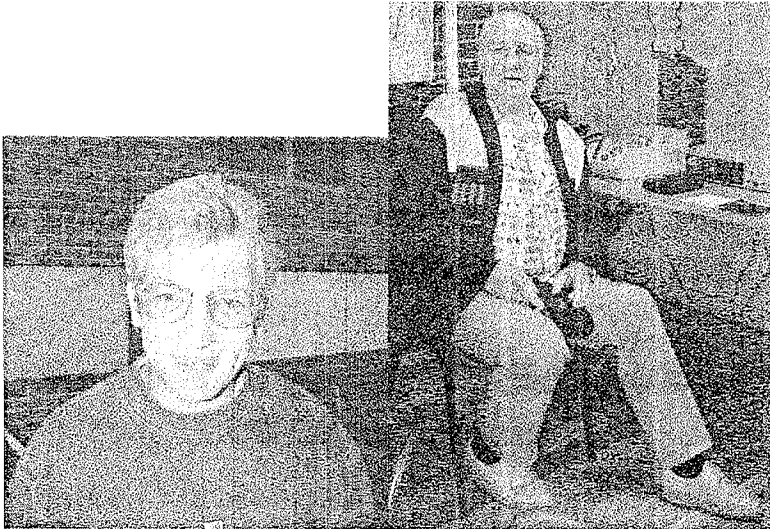
THE DJ FOR THE NIGHT