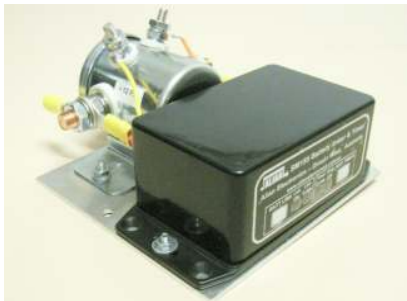
The SM155 battery link version is shown here