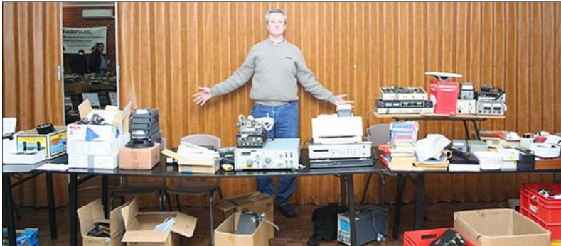
VK3TGX table - Someone's already put a marker on the old BWD scope!