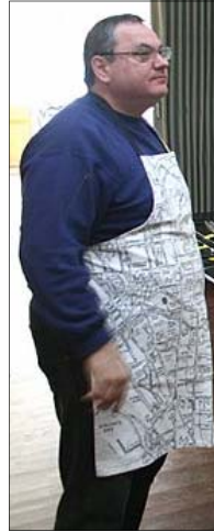
The pensive chef