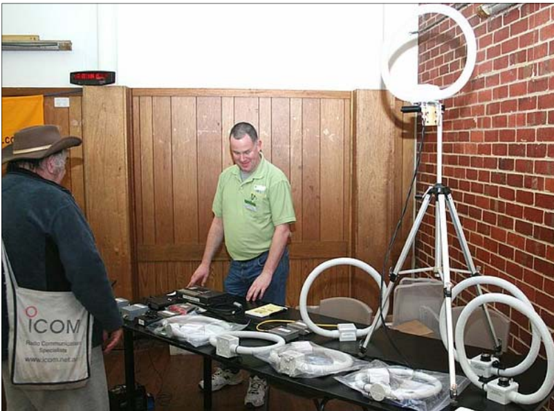
PK's Loop Antennas [NB Lots more of Paul's pics are at www.paulstubbs.pozzie.net/ ]