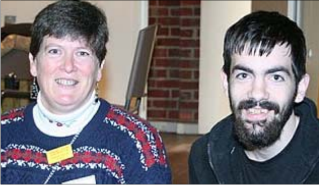
Smiles at the front desk, collecting entry fees