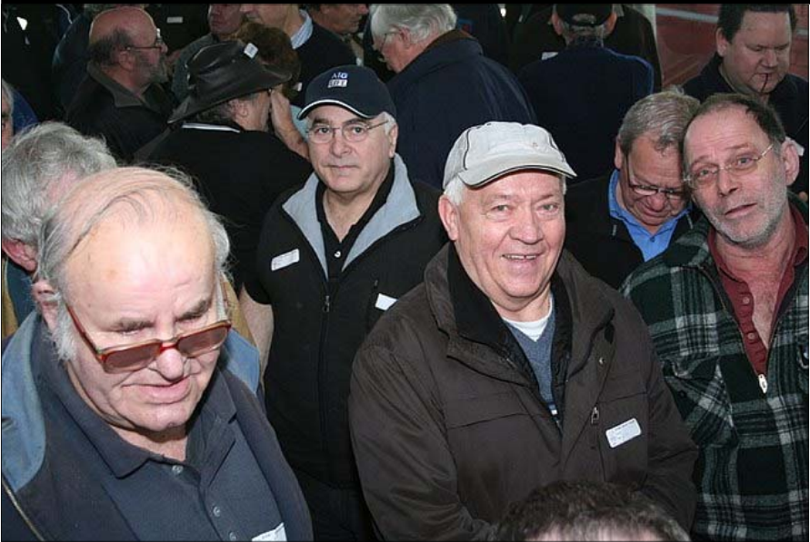
9:40 and they are champing at the bit