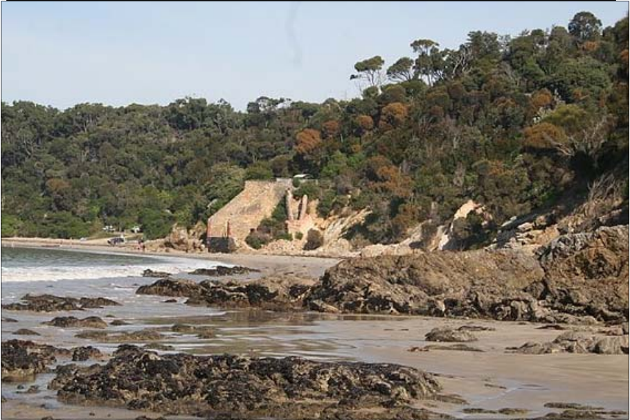
Above : Part of the lime kilns at Walkerville.