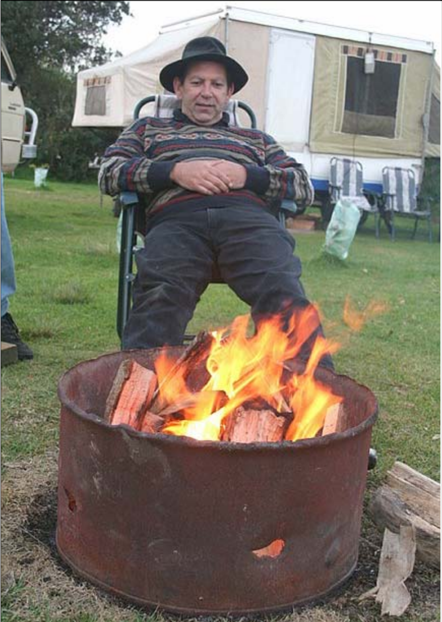
The New Treasurer at Walkerville: Luxury Luxury!! Words'n'pics Paul VK3TGX