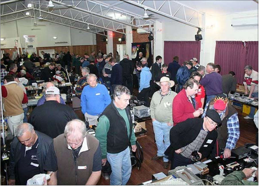
GGREC HAMFEST 2010