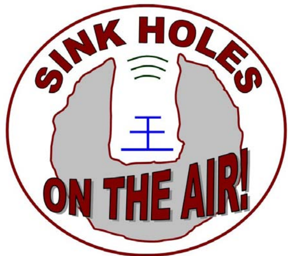
The distinctive SOTA logo

The essence of this new DX craze is to find a large hole in the ground, set up your transmitters and antennas at the bottom and see how many other operators you can contact. Points are awarded in accordance with a complex formula based upon the diameter and depth of the hole. Double-points are awarded for Sink Hole – to Sink hole contacts.