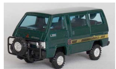
The latest in collectable matchbox toys circa 1985

The cars we were driving back then were a lot more boxy than today. Square shapes and high wind loading being the style at the time. Mitsubishi chose 1985 to formally launch their new 4WD van series, so it wasn't the worst year in the world to live in.